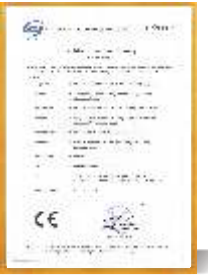
CE Certificate for Electric Scooter