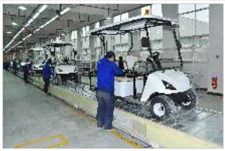
Automatic Production Line of Golf Cart