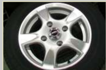
Aluminium Rim For DN-14