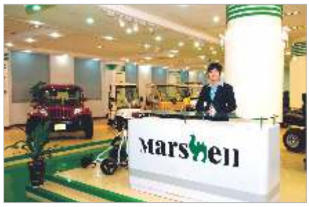
Shanghai Factory Showroom