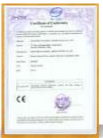
CE Certificate for Sightseeing Vehicle