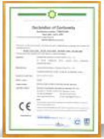
CE Certificate for Mobility Scooter