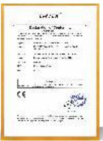
CE Certificate for Golf Car