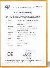
CE Certificate for Hunting Car & Utility Vehicle