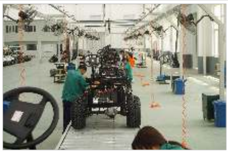
Automatic Production Line