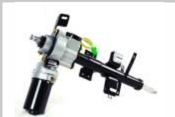
Power-assisted steering system