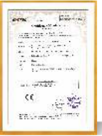
CE Certificate for Mobility Scooter