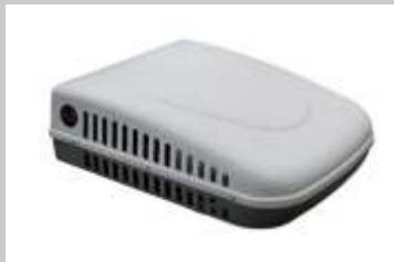
Vehicle Mounted Air Conditioning