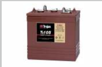
Trojan Battery (from USA)