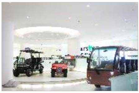
Guangdong Factory Showroom