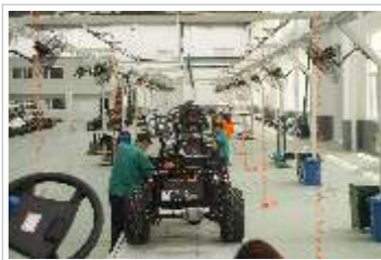
Automatic Production Line